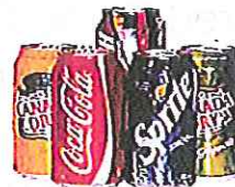
Aluminum Cans, Aluminum Foil & Pie Tins