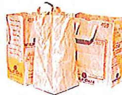
Brown Paper Bags