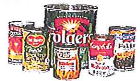
Steel Cans & Empty Aerosol Cans